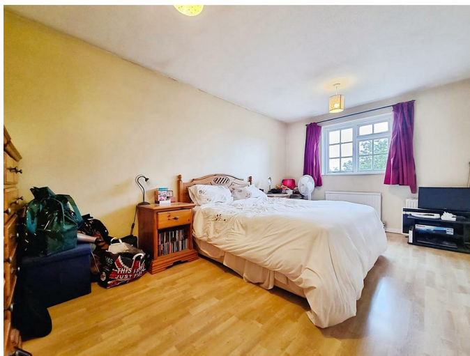
Bedroom One 15'11 x 9'10 (4.85m x 3.00m)