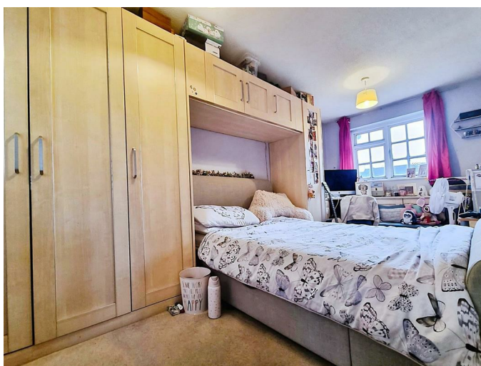
Bedroom Two 16'1 x 7'10 (4.90m x 2.39m)