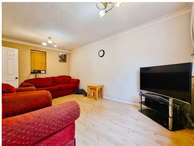
Living Room 15'11 x 9'10 (4.85m x 3.00m)