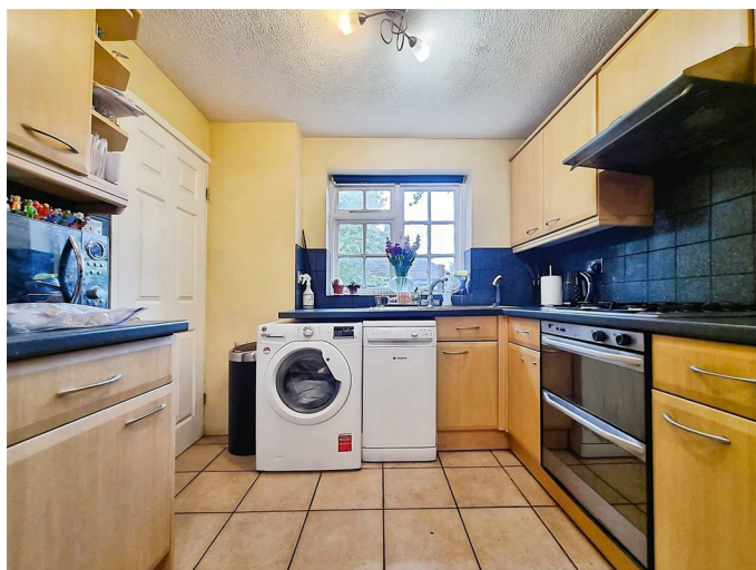
Kitchen 8'8 x 6'10 (2.64m x 2.08m)